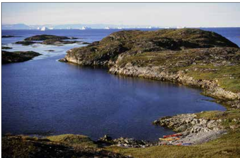
Right foreground, our red and yellow kayaks on a beach where we overnighted on an old house site before crossing to Disco Island

lea's slides of what he termed 'boring days in Disco Bay' were visually stunning, glassy seas festooned with humungous glassy icebergs. He also easily solved our logistics problem with airline schedules and contact addresses.