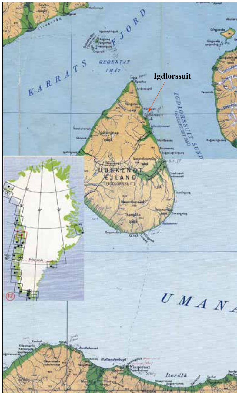
1:250,000 scale map showing our paddling route to Ukbent Eylandt

With a population of 120 people and 550 dogs, fishing is the mainstay of the village, carried out throughout