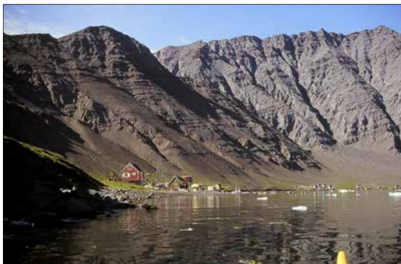
The small west Grønland village of Igdlorssuit, 120 people and 550 dogs

We arrived late morning on a gloriously calm day, no wind, blue skies and the sea dotted with huge lumps of ice from calving glaciers across the sound. Fish drying racks and parked