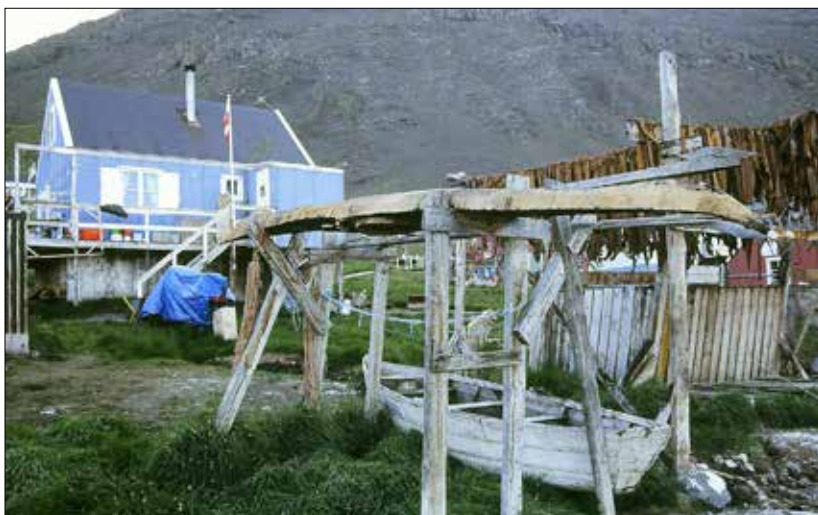
The Igdlorssuit seal skin-covered traditional kayak which had such similar lines to our Nordkapps.